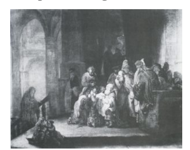
Fig 1. Gerbrand van den Eeckhout, The Presentation of Christ in the Temple , ca. 1665, oil on canvas, Gemäldegalerie, Dresden