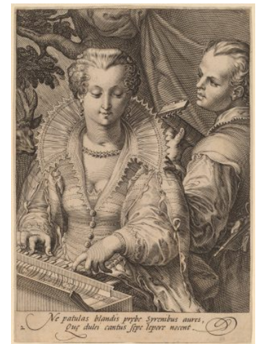
Fig 10. Jan Saenredam after Hendrick Goltzius, The Sense of Hearing , ca. 1595, engraving, 173 x 123 mm, National Gallery of Art, Washington D.C., Rosenwald Collection, inv. no. 1943.3.4640.