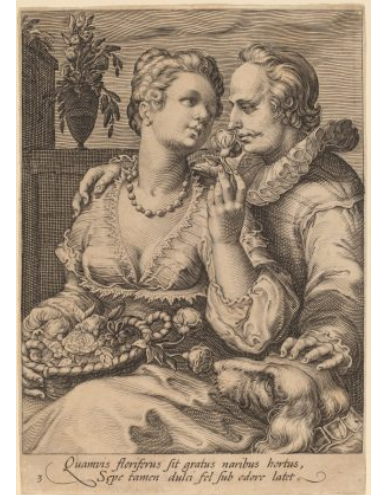
Fig 11. Jan Saenredam after Hendrick Goltzius, The Sense of Smell , ca. 1595, engraving, 173 x 123 mm, National Gallery of Art, Washington D.C., Rosenwald Collection, inv. no. 1943.3.4640.