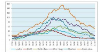
Fig 1. Graph: The Number of Painters in Six Cities in Holland: 1590–1710.