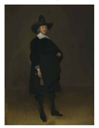
Fig 1. Gerard ter Borch, Portrait of a Man , about 1660, oil on canvas, 66.5 x 49.4 cm, Alte Pinakothek, Munich, inv. 8128