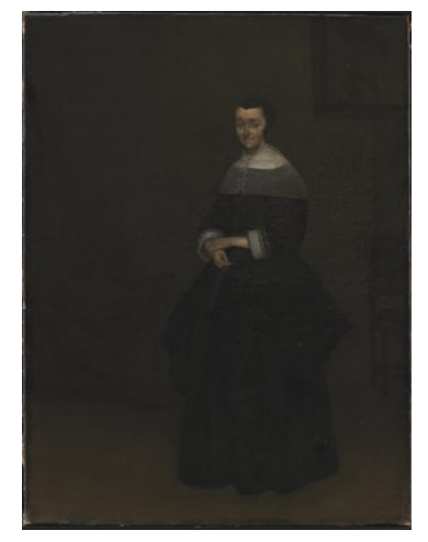
Fig 2. Gerard ter Borch, Portrait of an Older Woman , about 1660, oil on canvas, 62.5 x 47 cm, Statens Museum for Kunst, Copenhagen, inv. 418