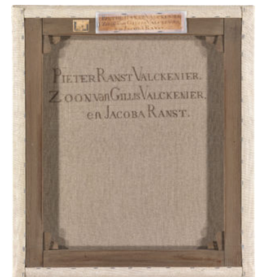
Fig 3. Reverse of MM-102.a revealing the inscription identifying the sitter. The original inscription on the old linen was reproduced in Mylar-encapsulated images and attached to the tops of the reverse, while the contents of the inscription was copied onto the relined canvas.