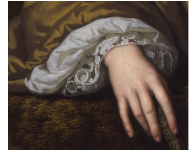
Fig 1. Detail of MM-102.a showing the delicate shadow of the sitter's proper right cuff on the lace