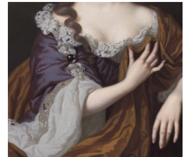
Fig 2. Detail of MM-102.b