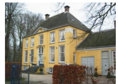
Fig 6. Valck en Heining mansion, Loenersloot (outside Amsterdam), built in 1677 by Cornelis Valckenier (1640–1700), second cousin of Pieter Ranst Valckenier