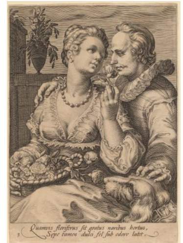
Fig 11. Jan Saenredam after Hendrick Goltzius, The Sense of Smell , ca. 1595, engraving, 173 x 123 mm, National Gallery of Art, Washington D.C., Rosenwald Collection, inv. no. 1943.3.4640.

In 1987–88 Stone Operation (Allegory of Touch)