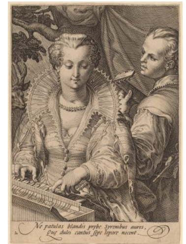
Fig 10. Jan Saenredam after Hendrick Goltzius, The Sense of Hearing , ca. 1595, engraving, 173 x 123 mm, National Gallery of Art, Washington D.C., Rosenwald Collection, inv. no. 1943.3.4640.