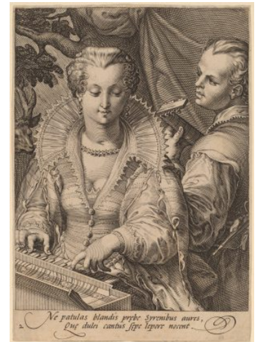
Fig 10. Jan Saenredam after Hendrick Goltzius, The Sense of Hearing , ca. 1595, engraving, 173 x 123 mm, National Gallery of Art, Washington D.C., Rosenwald Collection, inv. no. 1943.3.4640.