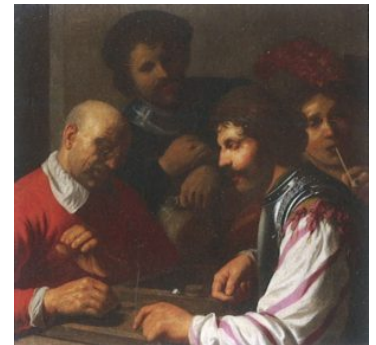
Fig 15. Jan Lievens, Tric Trac Players , 1624/25, oil on panel, 98 x 106 cm, Spier Collection, London.