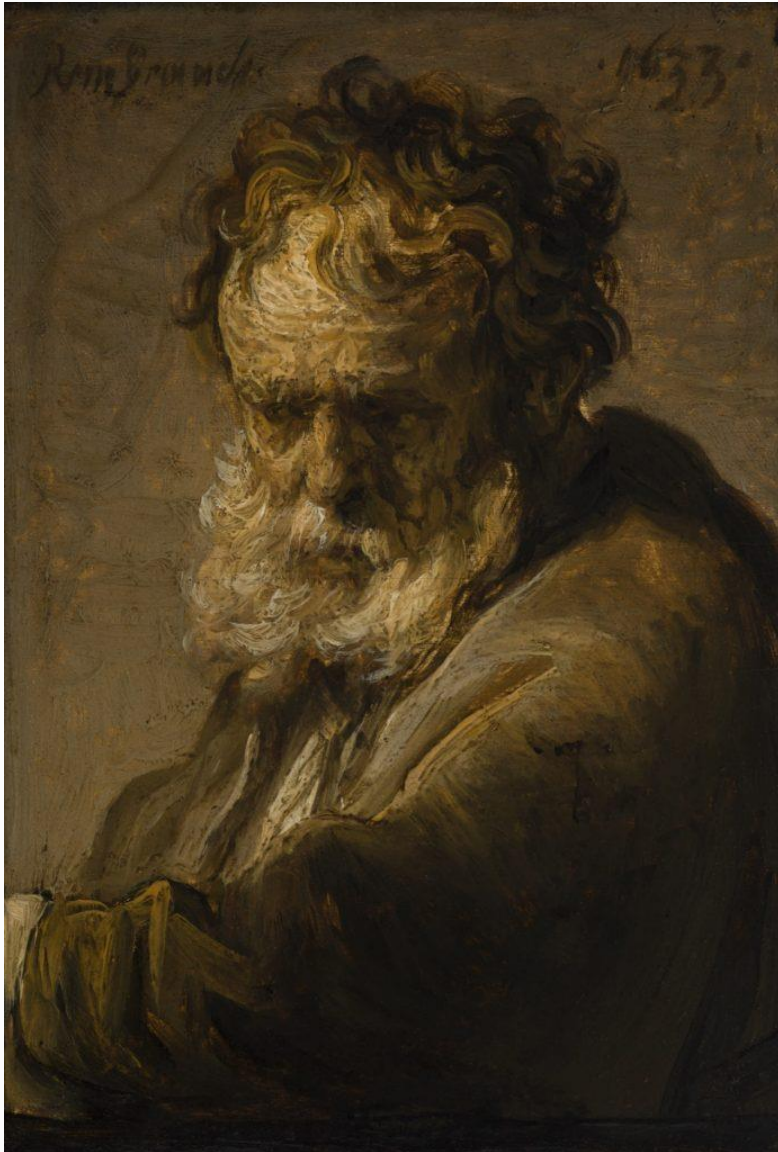
Rembrandt van Rijn (1606-1669) Bust of a Bearded Old Man. 1633. Oil on paper, mounted on panel.

The artworks will provide visitors an insight into the artistic period when the Dutch Republic was leading the way in the fields of trade, science and the arts.