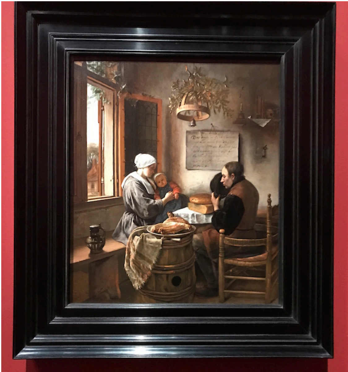
Jan Steen (1626 – 1679) Prayer Before The Meal 1660 Oil on Oak panel