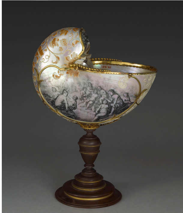
Cornelis van Bellekin (about 1625-after 1711) Nautilus shell engraved with scenes of the Roman divinities Bacchus and Diana Bathing 1660-80

The exhibition is divided into six thematic sections: