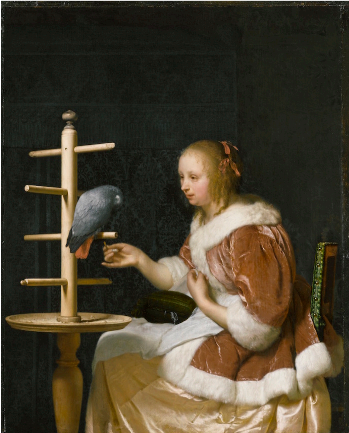
Frans van Mieris the Elder (1635-1681) Young Woman Feeding a Parrot 1663 Oil on panel New York, The Leiden Collection

– The Center of Golden Age: Rembrandt van Rijn in Amsterdam (with a fantastic cabinet of prints and drawings)