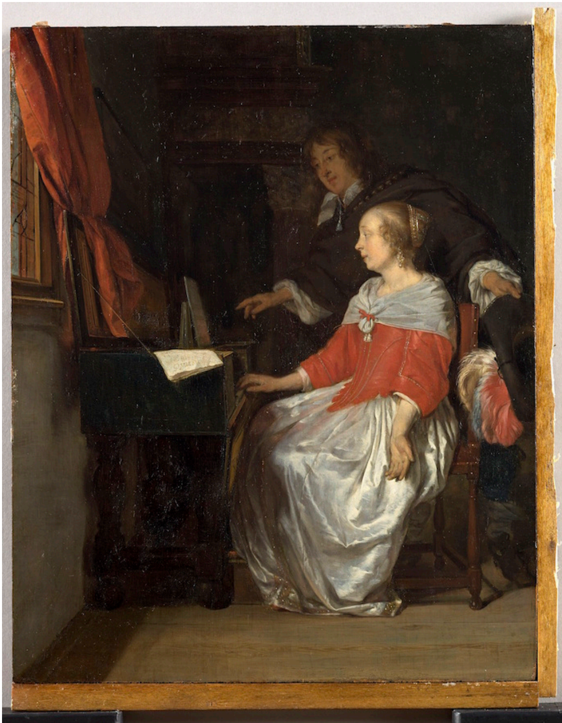
Gabriel Metsu (1629-1667) Paris, Musée du Louvre. INV1462.