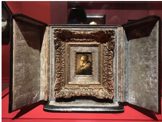
Bust of a Bearded Old man by Rembrandt van Rijn