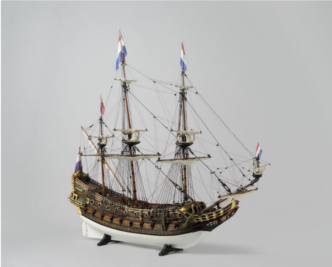
Dutch warship 1648 Wood, rope, lead, textile and paint Amsterdam, Rijksmuseum

In the first room, don't miss the very rare and beautifully crafted 17th-century ship model, a loan from Rijksmuseum. It's its first time travelling to the UAE!