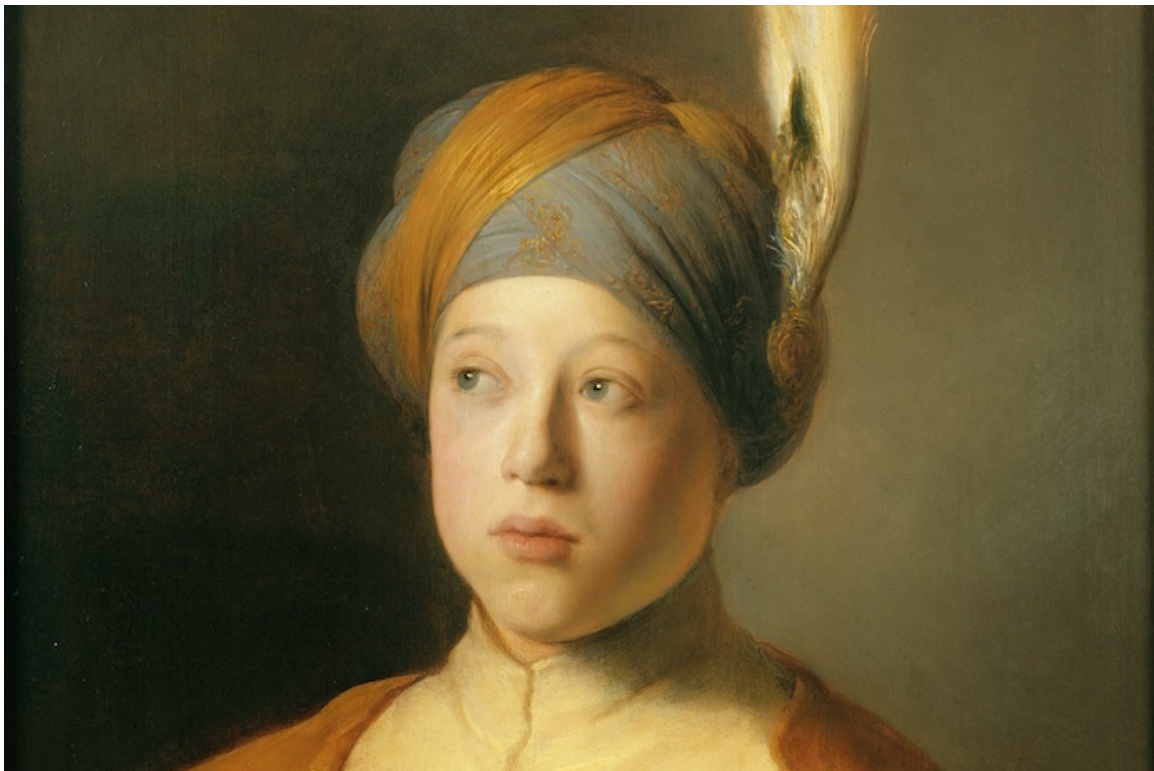
Jan Lievens (1607-1674) Boy in a Cape and Turban (Portrait of Prince Rupert of the Palatinate) ca. 1631 Oil on panel New York, The Leiden Collection

From 14 February to 18 May 2018, Louvre Abu Dhabi will present Rembrandt, Vermeer and The Dutch Golden Age: Masterpieces from The Leiden Collection and the Musée du Louvre.