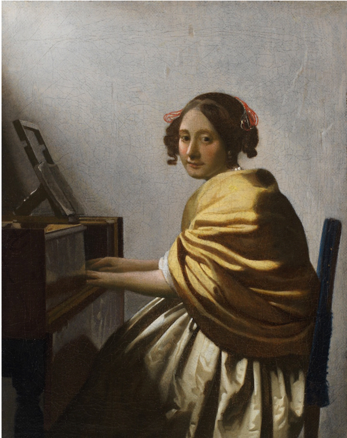
Johannes Vermeer (1632-1675) Young Woman Seated at a Virginal ca. 1670-72 Oil on canvas New York, The Leiden Collection