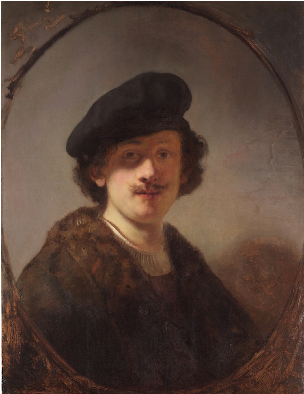
Rembrandt van Rijn (1606-1669) Self-Portrait with Shaded Eyes 1634 Oil on panel New York, The Leiden Collection

Visitors can also watch the paintings Rembrandt created later on in Amsterdam, such as the renowned Self-Portrait with Shaded Eyes (from The Leiden Collection).