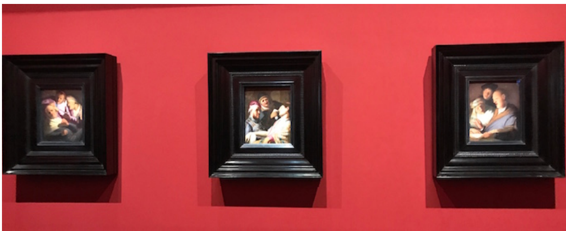
The early famed series of allegorical paintings of the Senses by Rembrandt van Rijn.

The exhibition surveys the evolution of Rembrandt's artistic career starting in his native Leiden where he created his early famed series of allegorical paintings of the Senses (3 displayed at the exhibition in the first room).