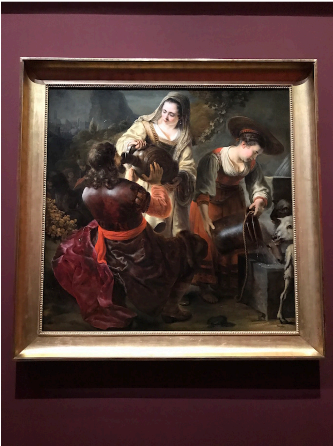
Ferdinand Bol (1616-1680) Rebecca and Eliezer at the Well ca. 1645-46 Oil on canvas

– Fine Paintings in Leiden: Gerrit Dou, Frans van Mieris, and their Contemporaries