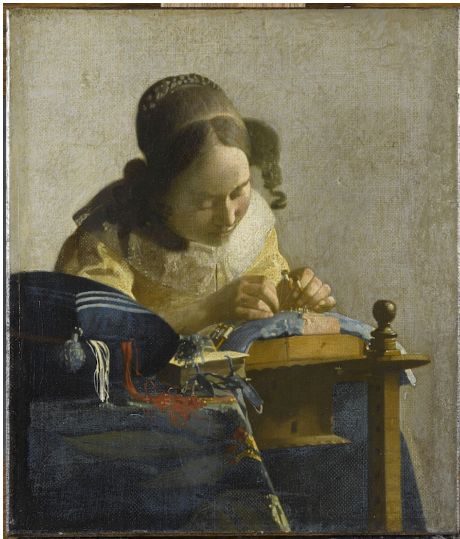
Johannes Vermeer (1632-1675). Paris, Musée du Louvre. M11448. The Lacemaker 1669-70, Oil on canvas mounted on panel

Among the many highlights in this exhibition are two works by Vermeer – The Lacemaker (musée du Louvre) and Young Woman Seated at a Virginal (The Leiden Collection) – that were painted on canvas cut from the same bolt. In this present exhibition, these have been hung side by side for what is thought to be the first time in 300 years.