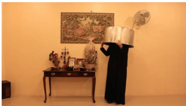
A still from The Salad Zone by Sarah Abu Abdallah.

Fonana (“female artist” in Arabic) at Foam in Amsterdam shows the work of eight artists from Saudi Arabia, in a sometimes humorous take on the restrictions imposed on women in that country.