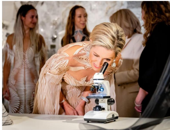
Queen Máxima at the museum opening, wearing Iris van Herpen, with Van Herpen standing behind her.

Let's make an exception to the rule and cast our net a bit wider to include the Paris exhibition of Dutch artist and fashion designer Iris van Herpen who is doing wildly imaginative things around the constant of the human body.