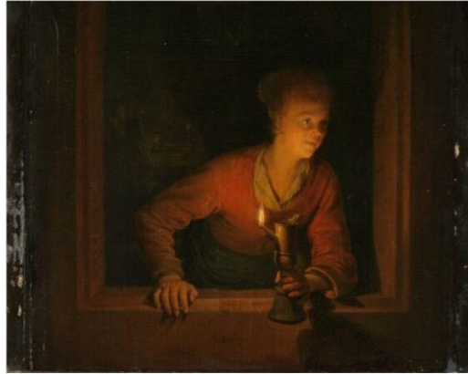
Girl with an oil lamp by Gerard Dou

There is Jan van Speijk who famously and perhaps apocryphally cried out “Dan liever de lucht in” (“I’d rather be blown skyhigh”) as he set fire to the powder keg to blow up his ship to keep it out of enemy hands. But there’s also the fire of the smithy and the domestic hearth, by such painters as Jan Steen, Gabriël Metsu, Gerard Dou, Philips Wouwerman, Jacob Maris and Martinus Schouman.