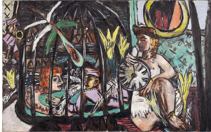
Max Beckmann, The soldier's dream 1942. Hilti Art Foundation, Vaduz

Here we are again, ready or not, at the start of another year. This is what January has in store.